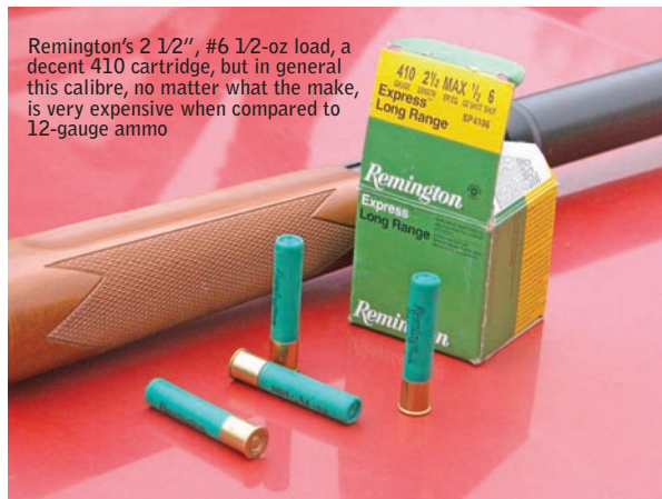
Remington's 2 1/2", #6 1/2-oz load, a decent 410 cartridge, but in general this calibre, no matter what the make, is very expensive when compared to 12-gauge ammo

There is really only one downside to this little gem and that is the price of cartridges, as 410 ammo is hideously expensive in comparison to 12-bore. Let us only hope that this calibre increases in popularity and the ammunition price drops accordingly. SS