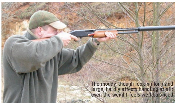
The moddy, though looking long and large, hardly affects handling at all; even the weight feels well balanced