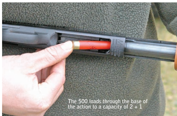
The 500 loads through the base of the action to a capacity of 2 + 1