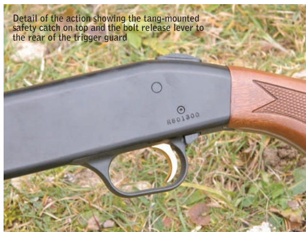
Detail of the action showing the tang-mounted safety catch on top and the bolt release lever to the rear of the trigger guard